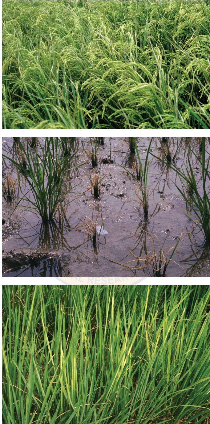
圖 1、台中秈 10 號水稻白葉枯病之三種病徵型（由上而下依序為葉枯型、kresek 急性萎凋型與淡黃化型）。

Fig. 1. Three types of symptoms of rice bacterial blight caused by Xanthomonas oryzae p. oryzae on rice Taichung Sen No. 10. Different disease symptoms showed as leaf blight (upper), kresek, the seedling blight or wilt phase of the syndrome (middle), and pale-yellow leaves (lower).