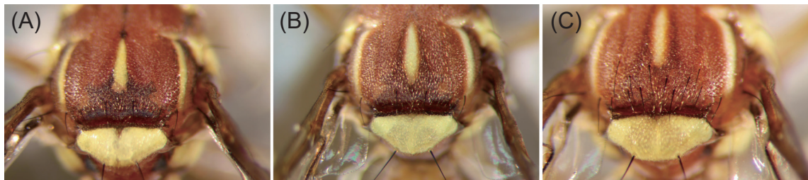
Fig. 1. The comparison of prsc. (A) the 2PHT of the 2P strain; (B) the 4PHT of the 4P strain; (C) the 12PHT of the MB strain. PHT: prsc-phenotype.

The occurrence of 2PHT surge is compared in two series of step-up phenotype crosses. (1) The 2PHT is chosen as the representing phenotype of the 2P strain to cross with the 4, 6 and 8PHT of 4P strain, and the 10, 12 and 14PHT of MB strain. (2) The 12PHT is chosen as the representing phenotype of the MB strain to cross with the 4, 6 and 8PHT of 4P strain, and the 10 and 12PHT of MB strain. Each cross